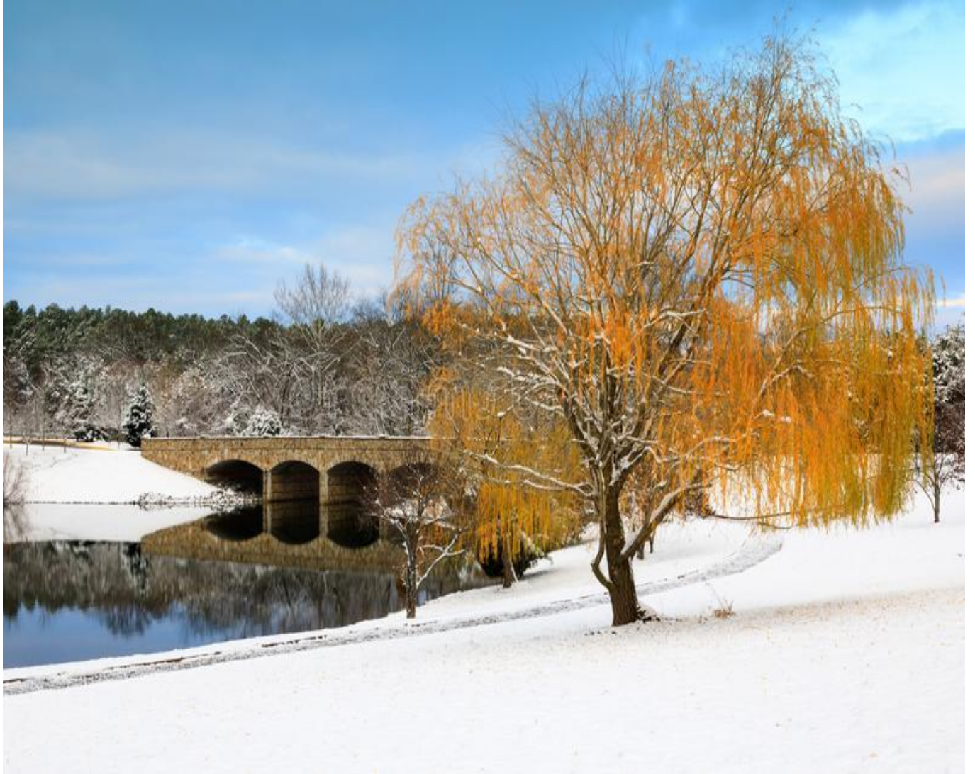
Fall to Winter Virginia