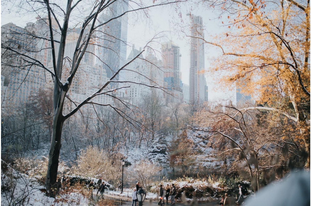
Winter New York City