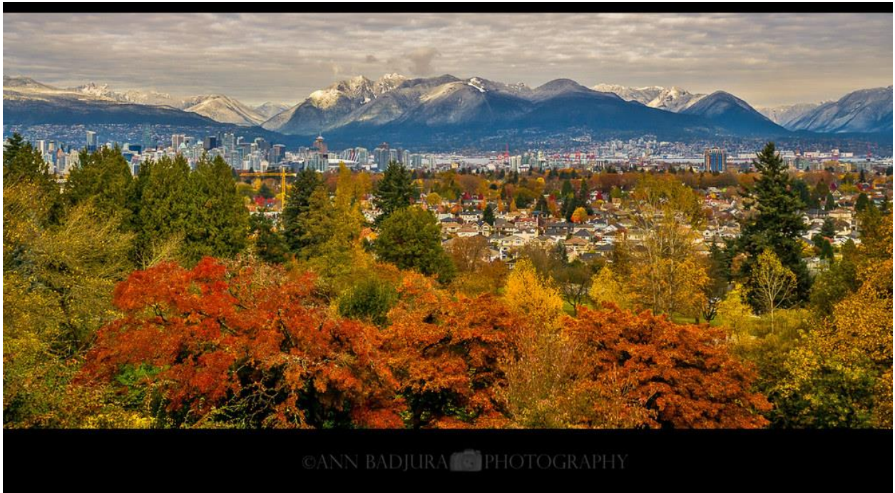
Fall, Vancouver, BC