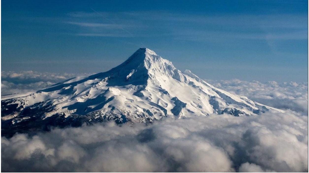
Winter, Mt Hood Oregon