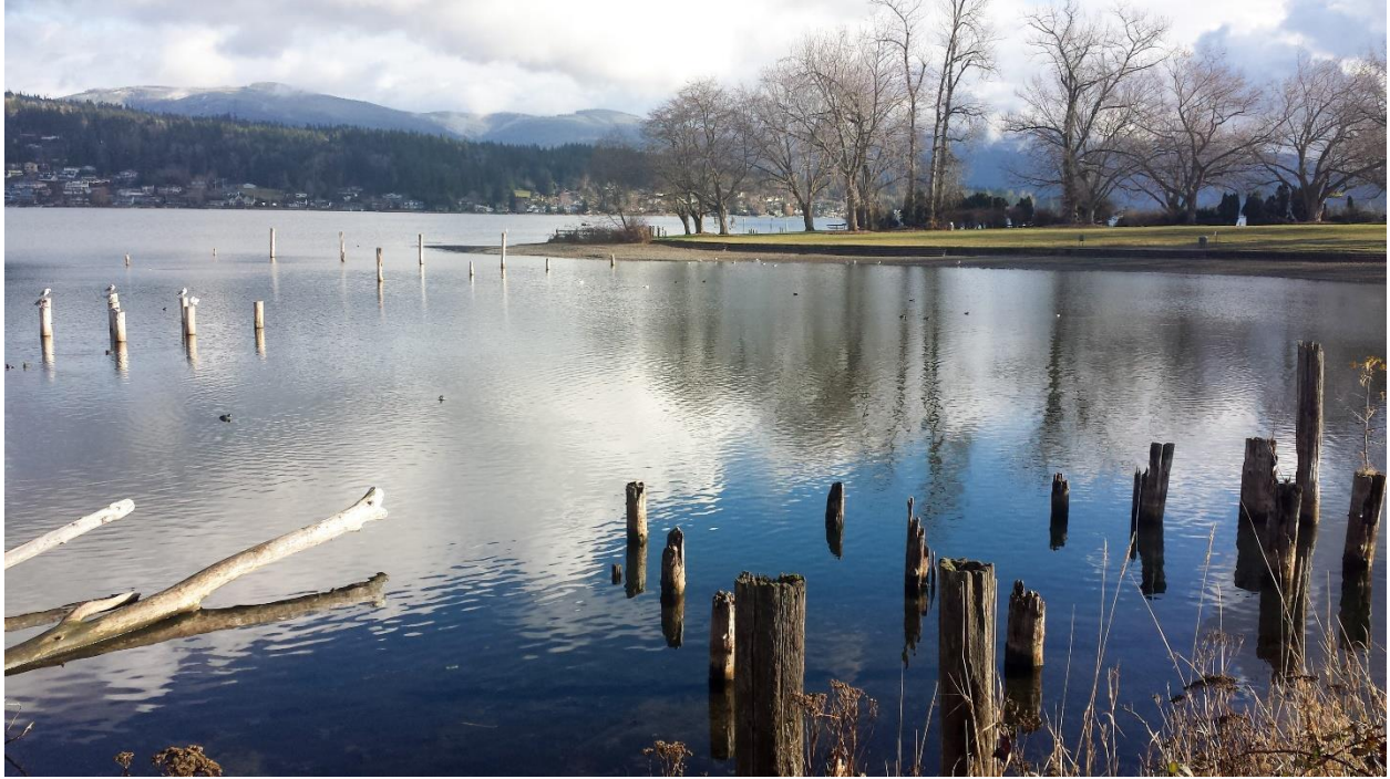
Lake Whatcom Bellingham Late Fall